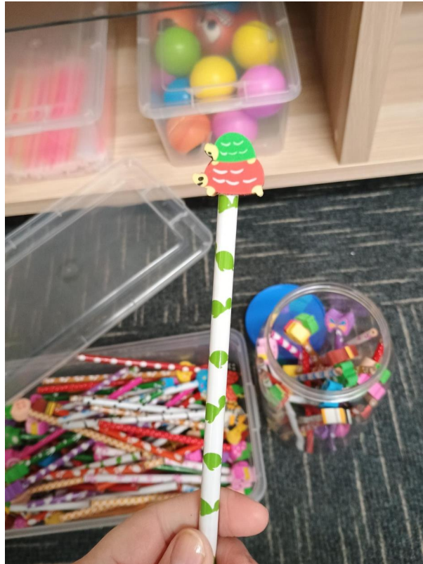
1 - 2 stamps - but lots of different ones to collect